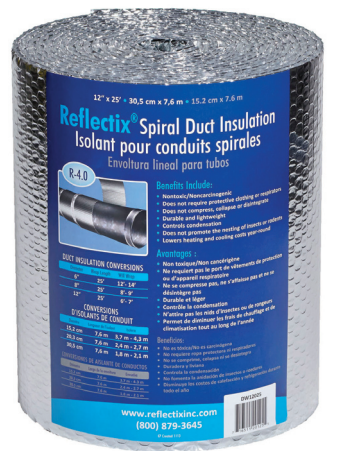
Plumbing/HVAC Products The "Easy-to Install" 12" x 25' Spiral Duct Wrap is featured above.