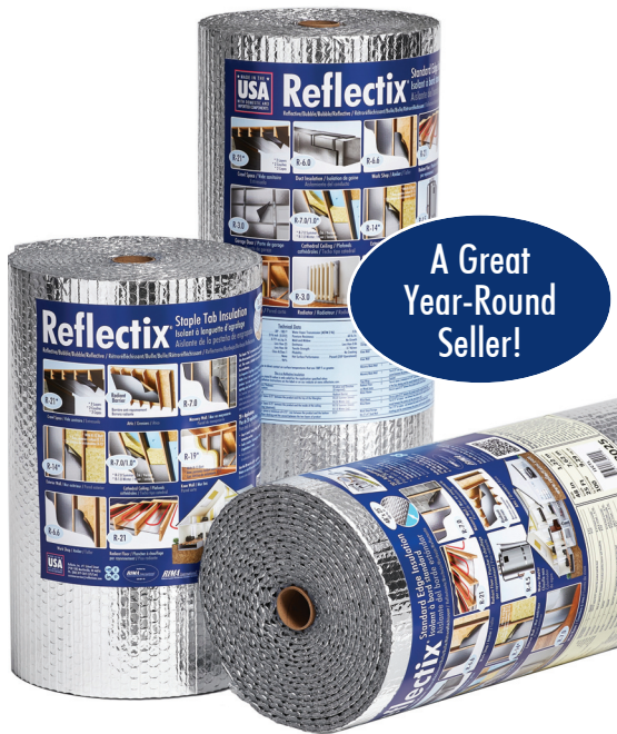
A Great Year-Round Seller!

We have the best in the industry with "easy to access" information on product options, applications and installations. www.reflectixinc.com