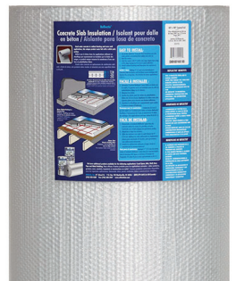
Concrete Pad This unique product coats foil with a white poly surface.