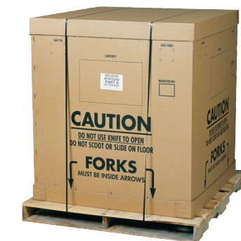
Corrugated Pallet Clean, neat and compact for your convenience.