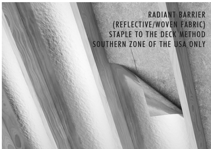
RADIANT BARRIER (REFLECTIVE/WOVEN FABRIC) STAPLE TO THE DECK METHOD SOUTHERN ZONE OF THE USA ONLY