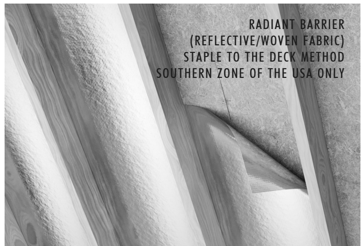
RADIANT BARRIER (REFLECTIVE/WOVEN FABRIC) STAPLE TO THE DECK METHOD SOUTHERN ZONE OF THE USA ONLY