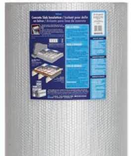
Concrete Pad This unique product coats foil with a white poly surface.