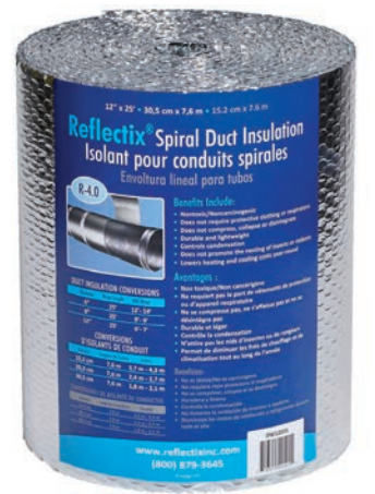
Plumbing/HVAC Products The "Easy-to Install" 12" x 25' Spiral Duct Wrap is featured above.