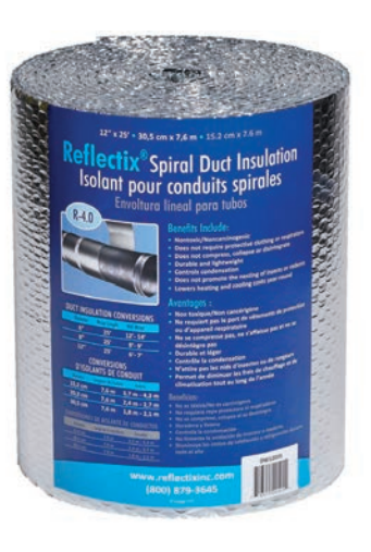
Plumbing/HVAC Products The "Easy-to Install" 12" x 25' Spiral Duct Wrap is featured above.

Concrete Pad This unique product coats foil with a white poly surface.