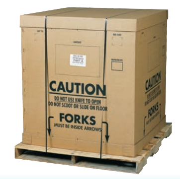
Corrugated Pallet Clean, neat and compact for your convenience.