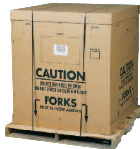
Corrugated Pallet Clean, neat and compact for your convenience.