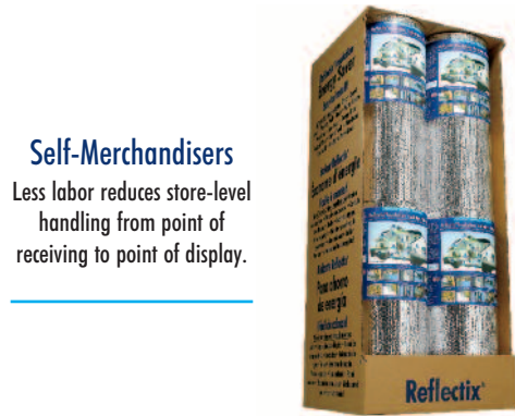
Self-Merchandisers Less labor reduces store-level handling from point of receiving to point of display.